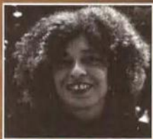
Angela Y. Davis

"In this extraordinary book, Angela Davis challenges us to confront the human rights catastrophe in our jails and prisons. As she so convincingly argues, the contemporary U.S. practice of super-incarceration is closer to new age slavery than to any recognizable system of 'criminal justice.'"